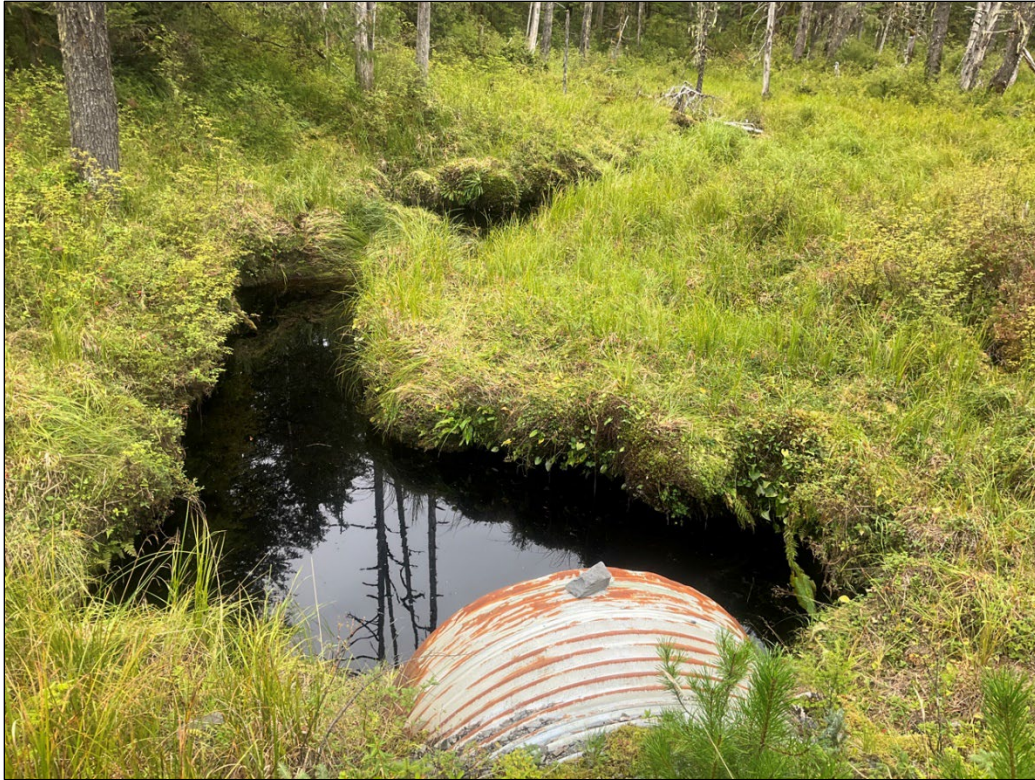
Figure 2.—Upstream channel at waypoint 713.