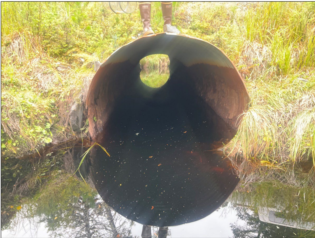
Figure 3.—Culvert at waypoint 713.