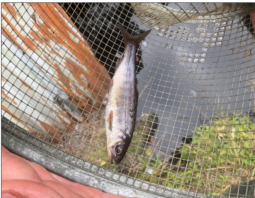
Figure 1.—Juvenile coho salmon captured at waypoint 713.